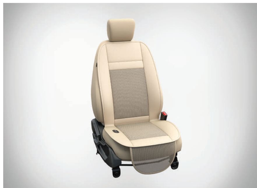
VENTILATED SEAT TOP COVER WITH MASSAGER – BEIGE