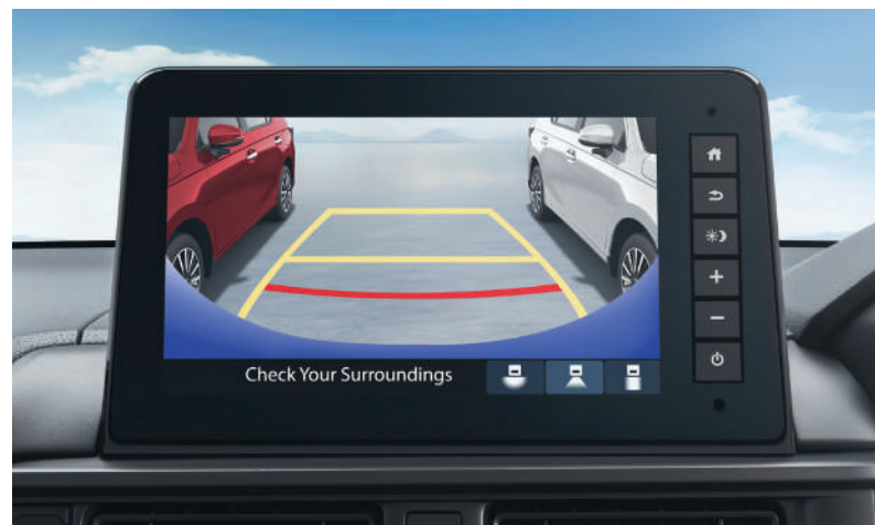
REAR CAMERA WITH GUIDELINES