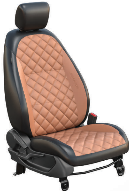
CROSS PATTERN (TAN & BLACK)