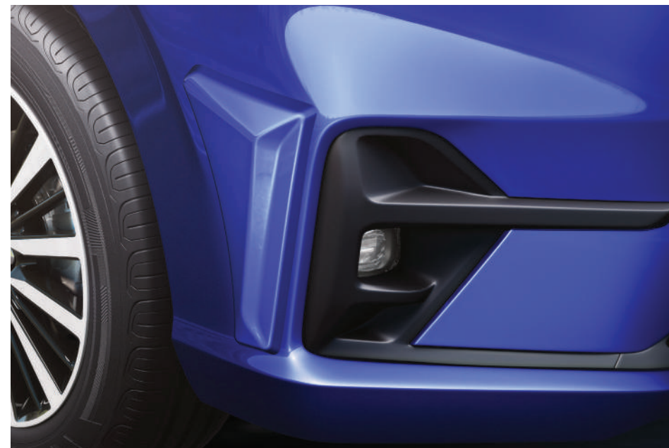
BUMPER CORNER PROTECTOR (FRONT AND REAR)