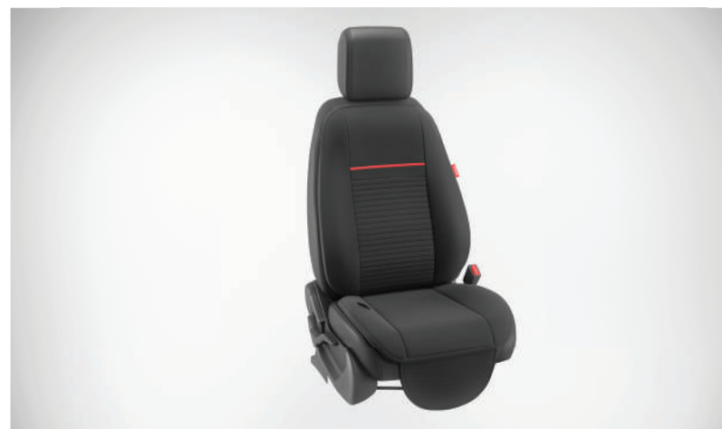
VENTILATED SEAT TOP COVER WITH MASSAGER – BLACK