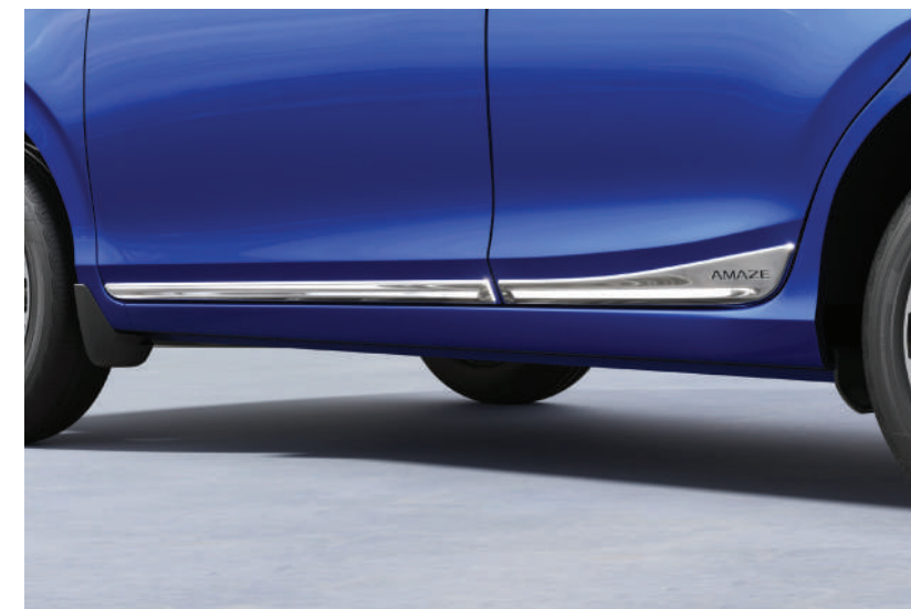
DOOR LOWER GARNISH