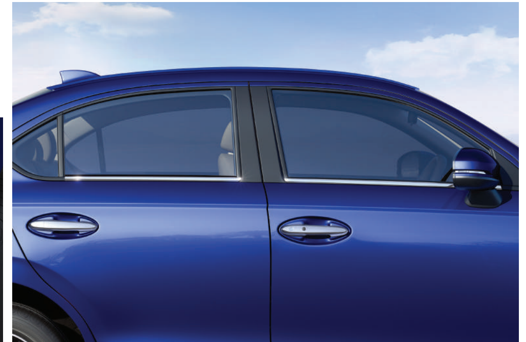
DOOR WINDOW CHROME MOLDING