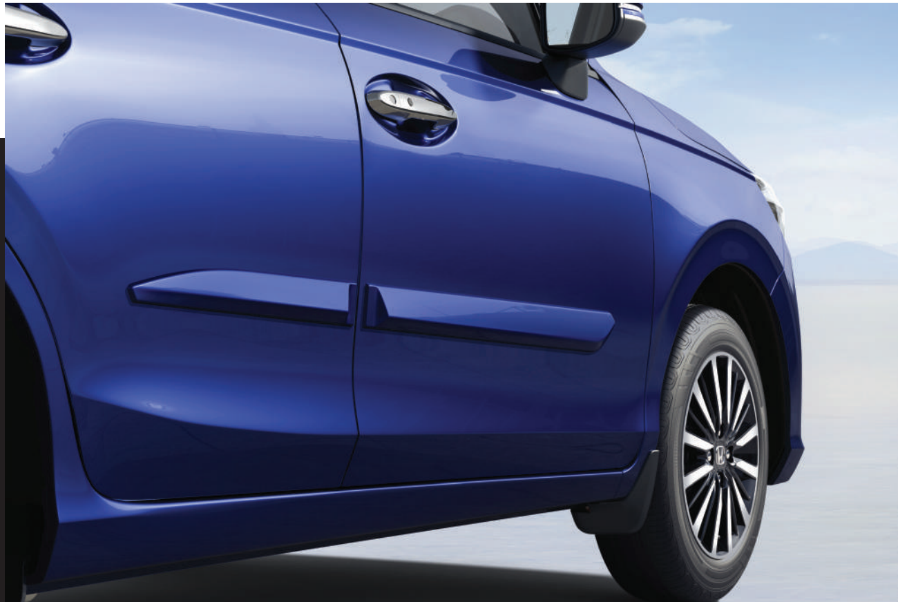
SIDE BODY PROTECTOR