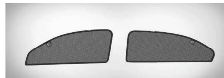
REAR DOOR SUNSHADES – SET OF 2 PCS.