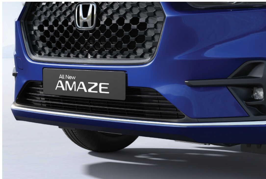
FRONT BUMPER GARNISH