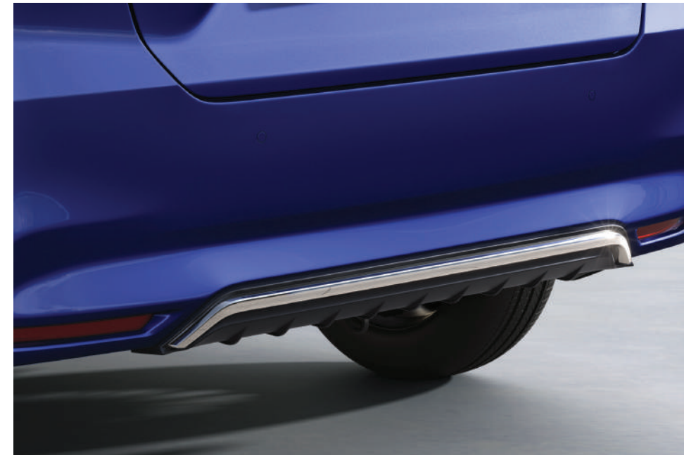
REAR BUMPER LOWER GARNISH