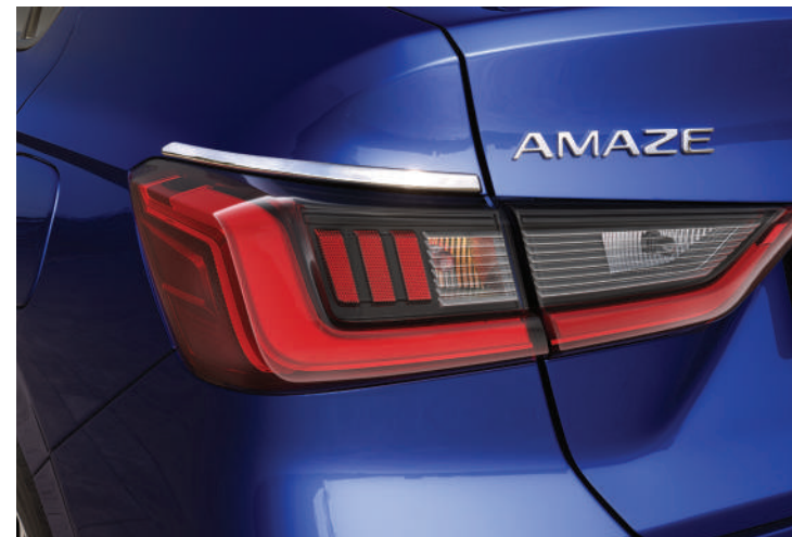
TAIL LAMP GARNISH