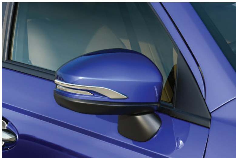
DOOR MIRROR GARNISH