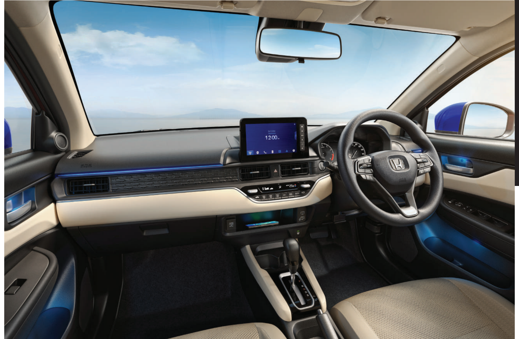
RHYTHMIC AMBIENT LIGHTS - 7 COLOURS