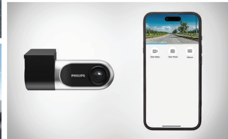
DRIVE VIEW RECORDER (DVR)