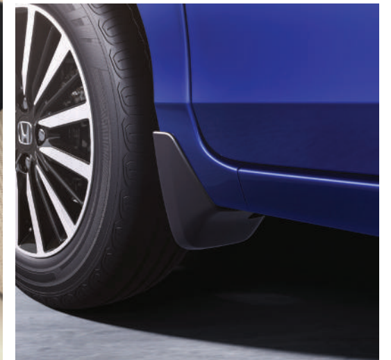
MUD GUARD SET