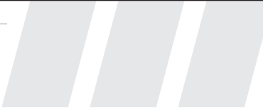
DOOR VISOR WITH CHROME