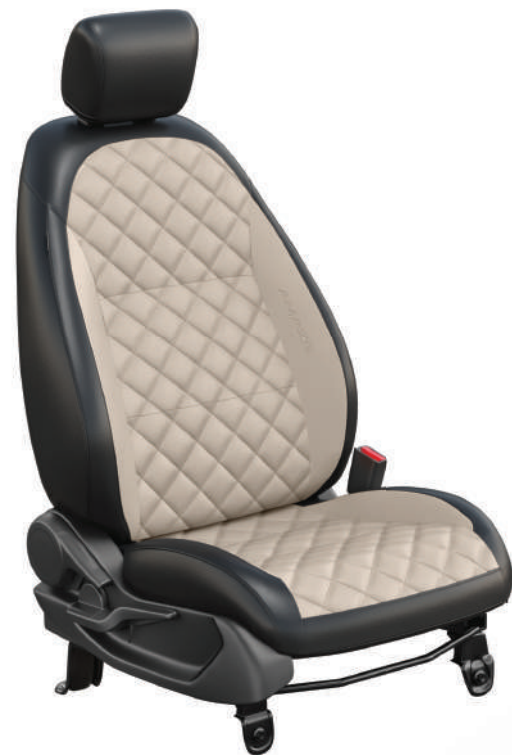
CROSS PATTERN (BEIGE & BLACK)