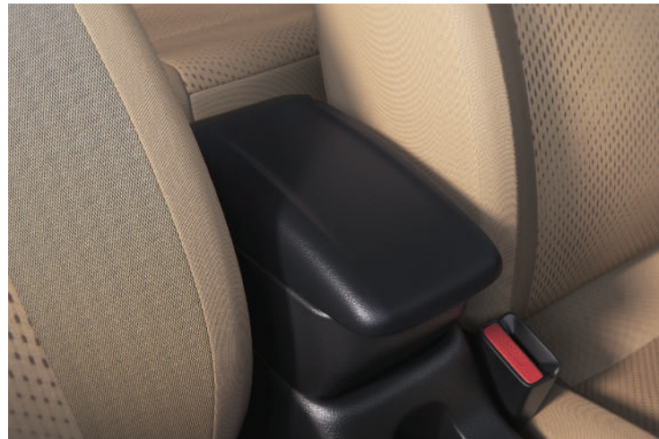
ARM REST – BLACK