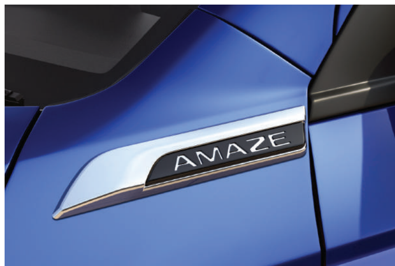
FRONT FENDER GARNISH