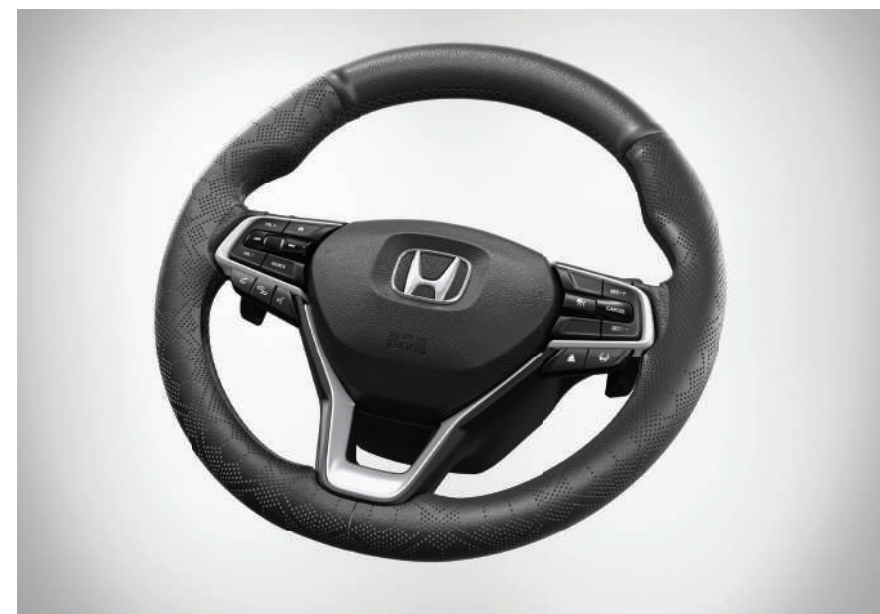
STEERING WHEEL COVER