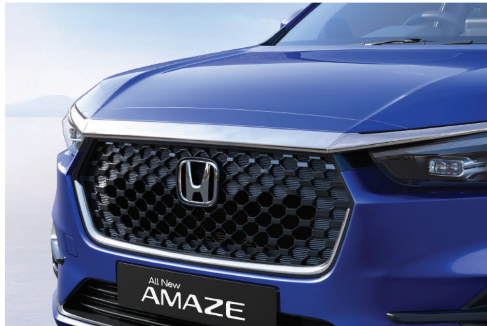
FRONT GRILLE GARNISH